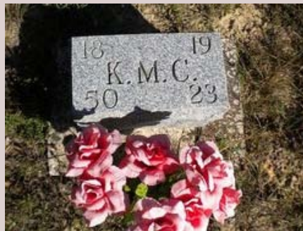
Added by: Vera Reeves