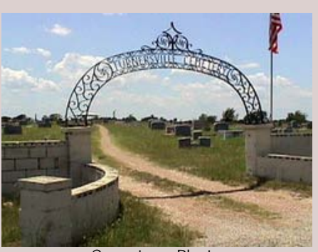
Cemetery Photo Added by: Rick Lewis